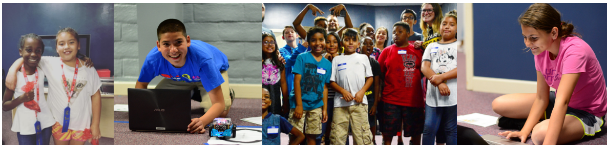
*Photos taken during our Robotics class 2017-2018

The goal of these classes is to increase interest in computer programming careers and increase diversity in the computer science workforce; ensuring that enough young people are inspired. At no cost to the students, Start Dream Big wants to expose them to an environment that unleashes their own potential, to disciple the next generation of community leaders to grow spiritually and gain life skills that will encourage them to lead in their homes, workplaces and communities.